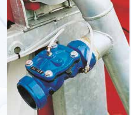
Water pilot operated drain valve.