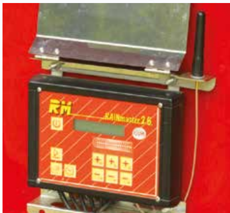
RM programmer, RainMaster 2.6 model (with antenna and in-built optional GSM module).