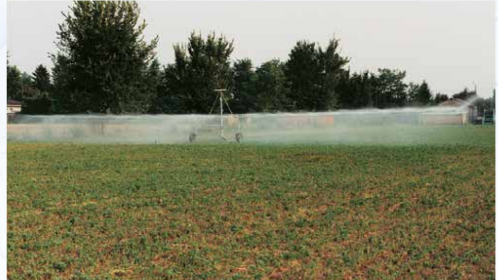
Steel boom with 30-metre structure