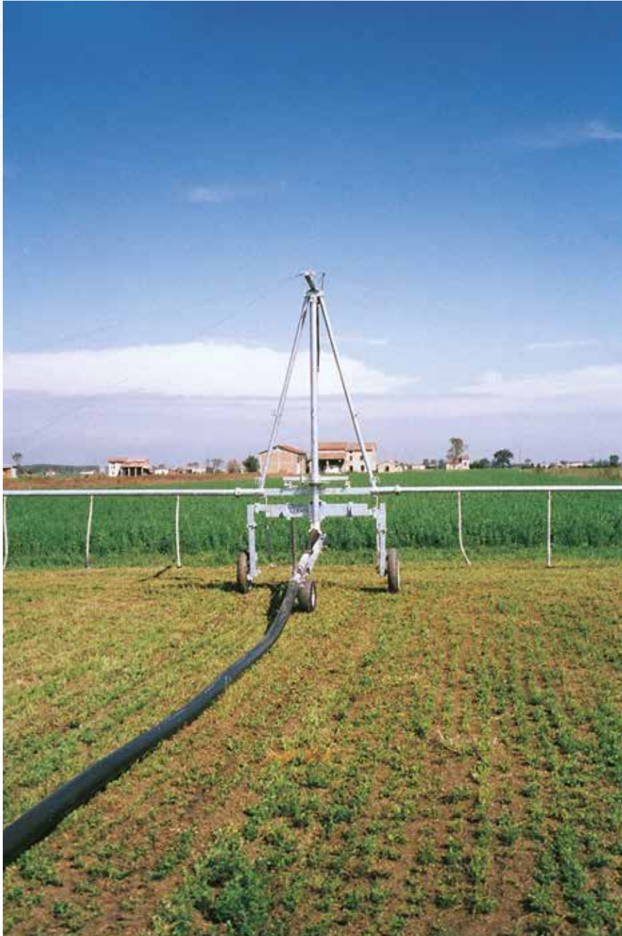
Steel boom for distributing sludge from 28 metres with descent