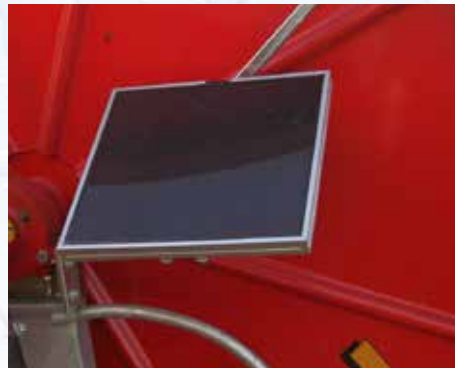
Solar panel for powering electronic equipment.