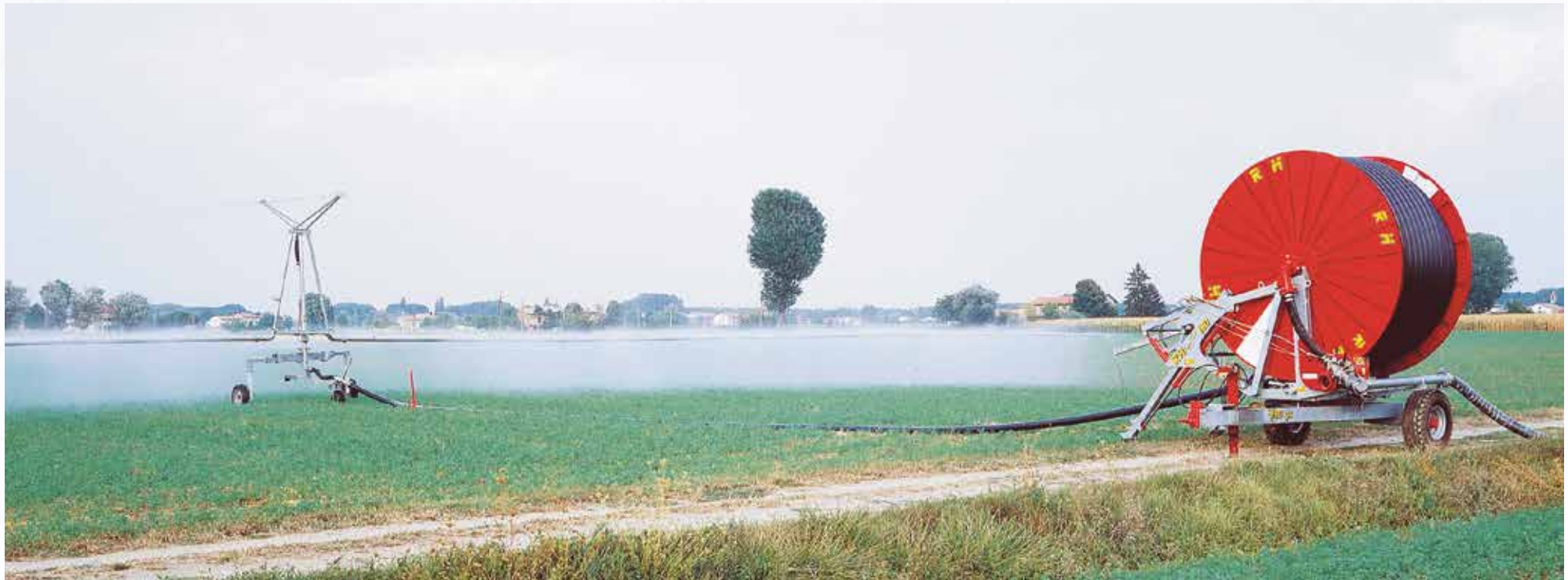
Steel boom with 50-metre structure assembled on the 890 Gx