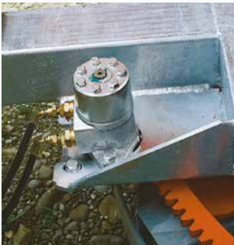
Hydraulic rotation of fifth wheel (standard on all the 990 Gx, 1100 Gx models; optional for all the other models).