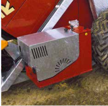
ECU operated by 4-stroke HONDA GX160 engine Hp 5.5 for hydraulic services.