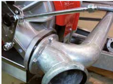
Transparent painting for boosting the protection of galvanized parts.