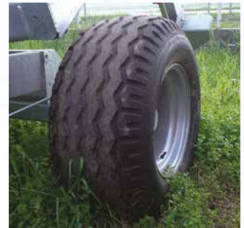
"Big size" type tyre for the 890 Gx, 990 Gx models, standard on the 1100 Gx model (size 15.0/55-17).