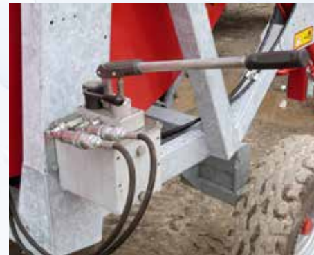
Manual pump for operating rear brackets and lifting trolley (optional for the 570 Gx Evo, 581 Gx Evo, 690 Gx, 790 Gx models).