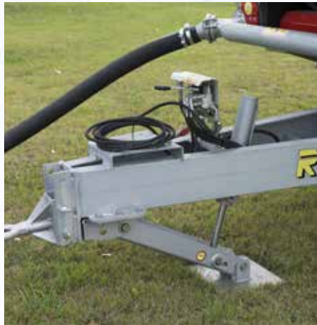
Hydraulic tilting rudder foot (optional for 790, 890, 990 and 1100 GX).