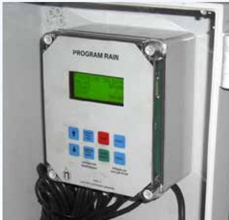
ProgramRain 10-12 – Nortoft programmer.