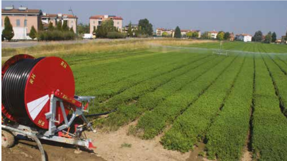
Steel boom with 30-metre structure