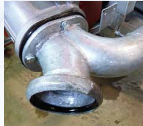
Water inlet on both sides (standard on all the Gx models starting from 581).