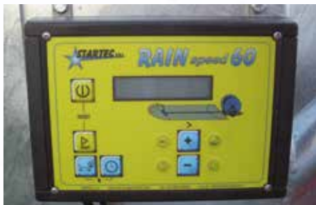
Rain Speed 60 digital metre counter for measuring the rewinding speed.