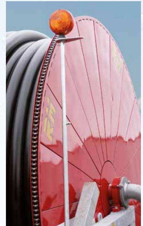
Signal of hose rewind end with xenon arc lamp for RM programmer.