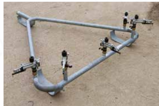
Under-foliage sprinkler device for orchards/vineyards in place of standard trolley.