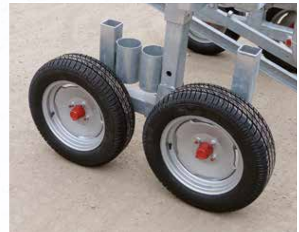
Four-pneumatic wheel trolley