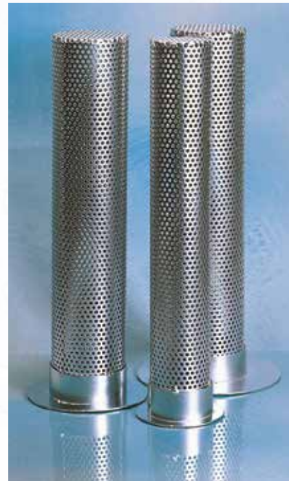
Inlet filter for B 76, 108 and 133 joint.