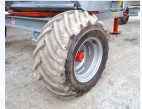
"Big size" type tyre for the 581 Gx Evo model size 26/12.00-12.