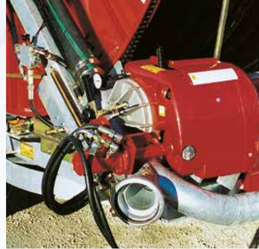
PE hose rewind through hydraulic motor on PTO, speed adjusting valve, limit switch spool valve and quick coupling torque to tractor.