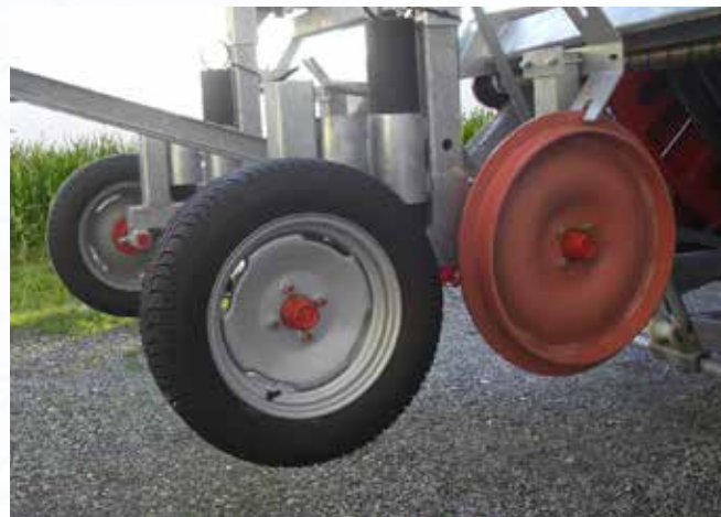
Trolley with two pneumatic wheels and two cast iron wheels.