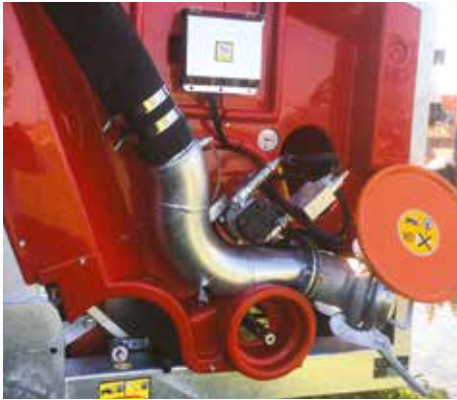
Hose rewind through YANMAR LD70 diesel engine complete with hydrostatic transmission with hydraulic motor on the reduction gear; speed compensating valve, double hydraulic pump for service feed; it can be paired with RM electronic programmers. The optional replaces the turbine rewinding.