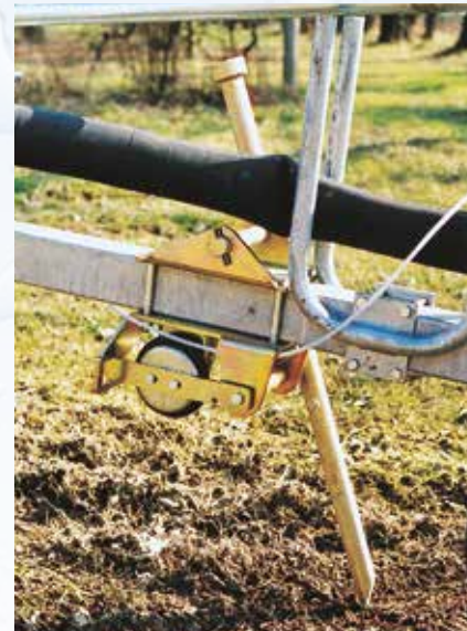
Device for locking trolley to the ground with pickax (for models with rear hose unwinding).