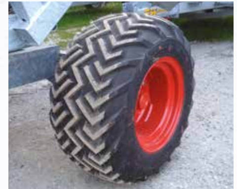
"Big size" type tyre for the 690 Gx Evo and 790 Gx models size 31x15.50-15.