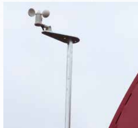
Anemometer for RAINMASTER 2.6.