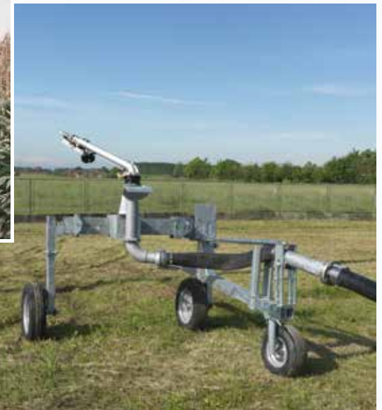
Kit for side unwind trolley.