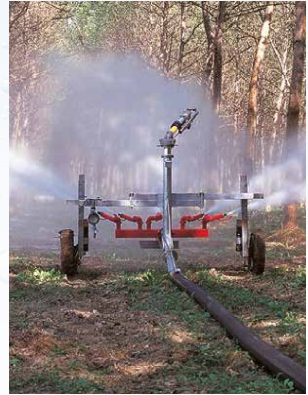
Under-foliage sprinkler device for tall tree.