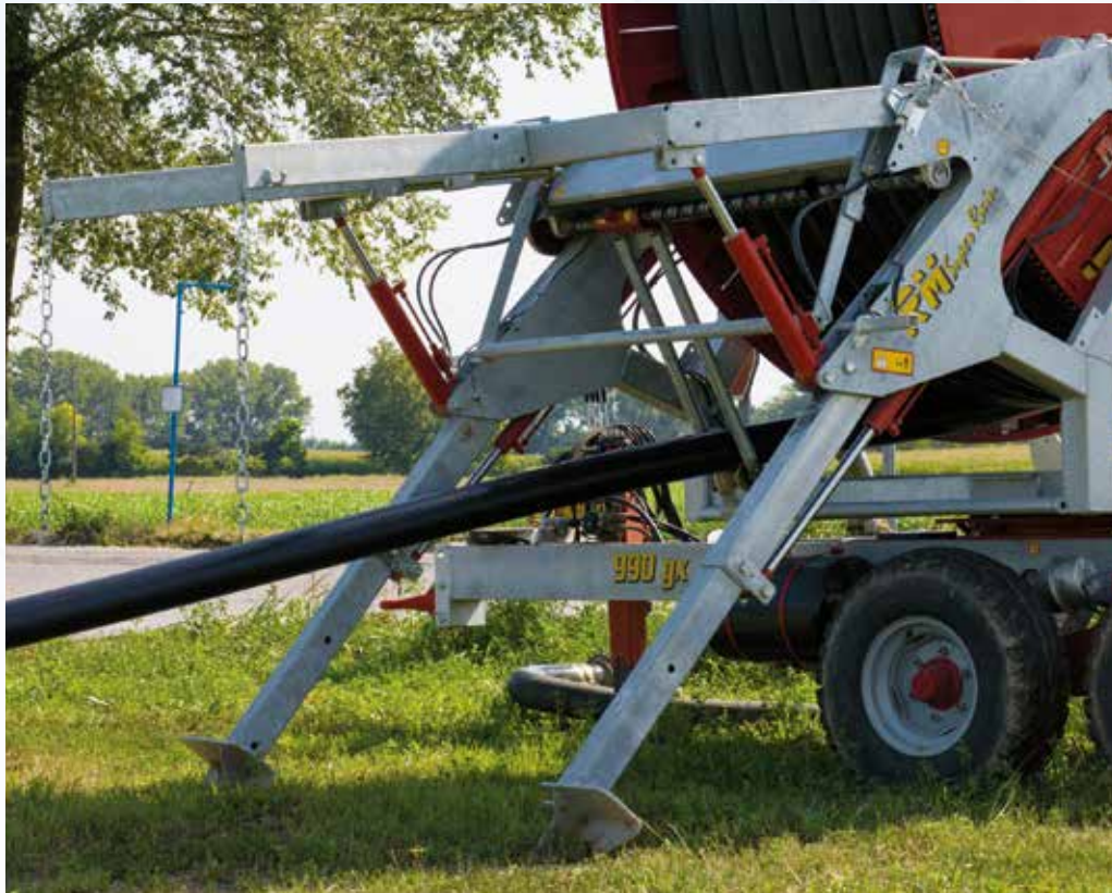
Independent trolley lifting controlled by a couple of hydraulic cylinders (mandatory with spraying boom) for the following models: 581 Gx, 690 Gx, 790 Gx, 890 Gx, 990 Gx e 1100 Gx.