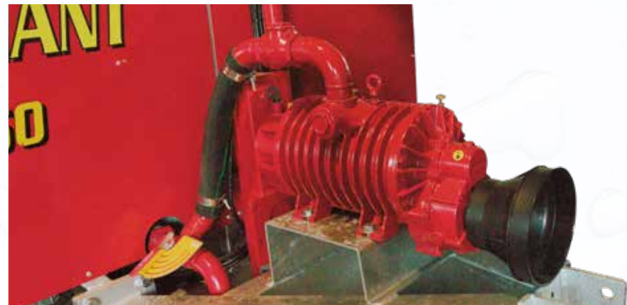
Compressor for emptying the hose JUROP 9000 lt.