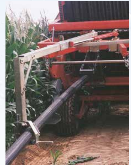
Arm for rear hose unwinding (optional for the 790 Gx, 890 Gx, 990 Gx, 1100 Gx models) and standard on the 1200 Fx.