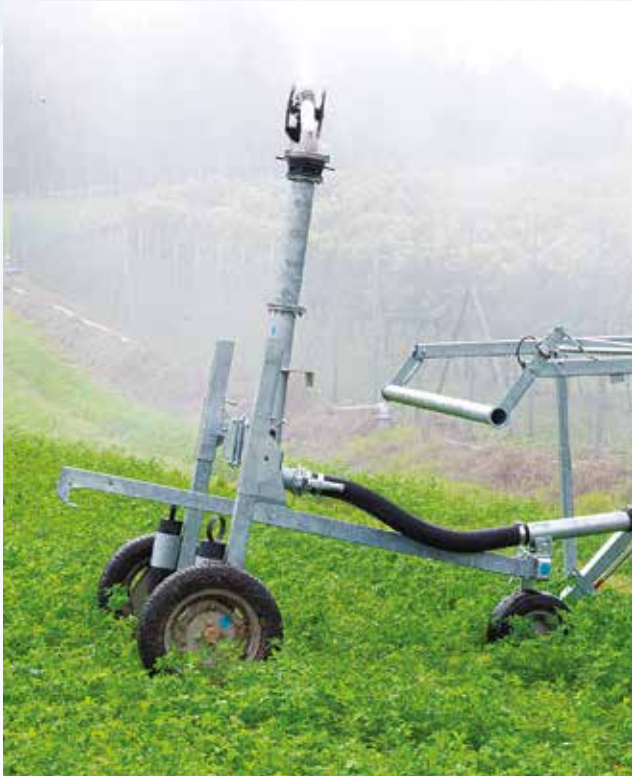
Trolley with three pneumatic wheels (standard) on all the Gx models.