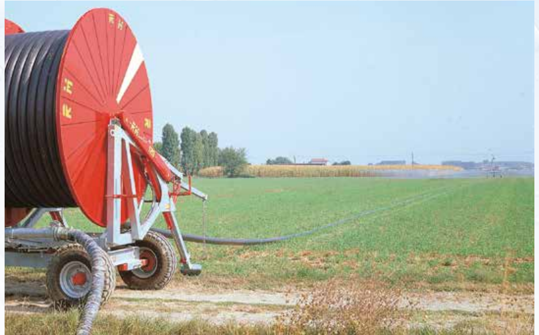
Steel boom with 40-metre structure