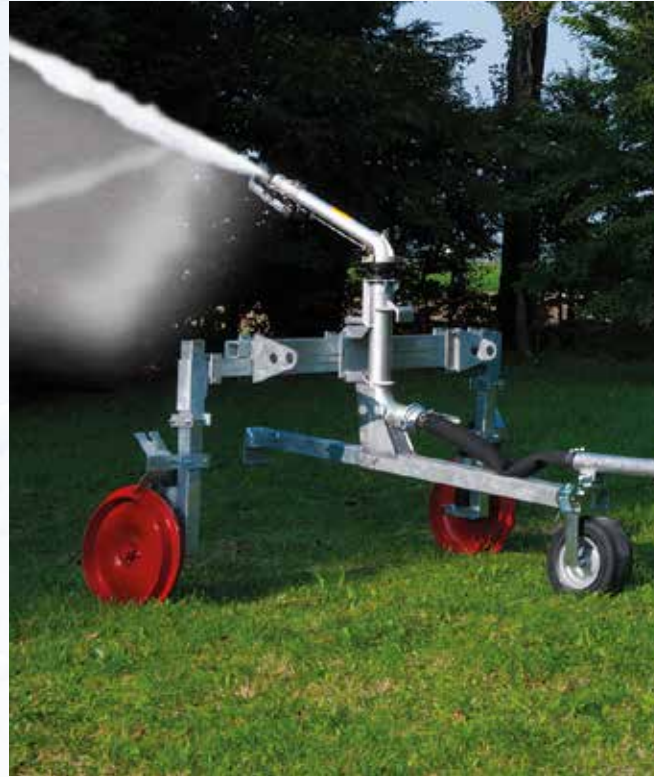
Trolley with single cast iron wheels (optional starting from the 570 Gx Evo model).