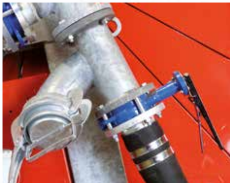
Additional coupler for sludge inlet and turbine cutting off.