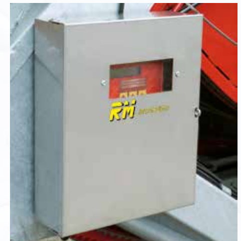
Protection stainless steel box for RainMaster 2.6 programmer.