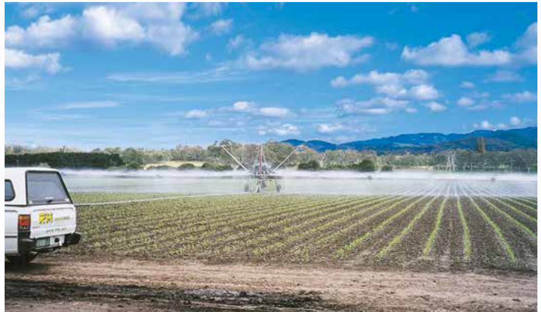
Albatros boom with 72-metre structure (optional for the 990 Gx and 1100 Gx models).