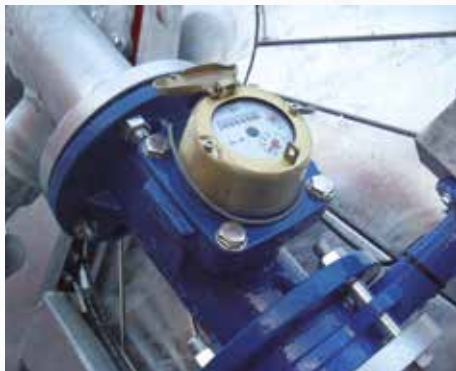
Flanged litre-counter on reel inlet.