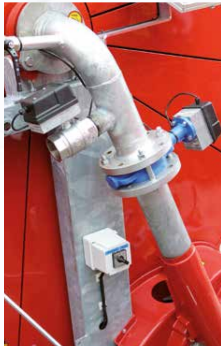
Electromechanical drain valve and electromechanical shut-off valve controlled by programmer (supplied separate or paired and controlled by electric switch).