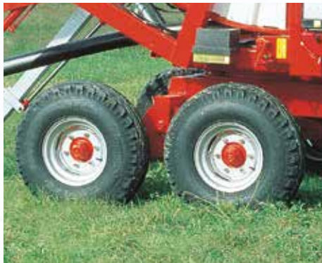
Double axle on asymmetrical rocker arm (optional for the 690 Gx, 790 Gx, 890 Gx, 890 Gx Evo models).