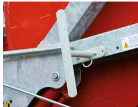
Amplified antenna for GSM module.