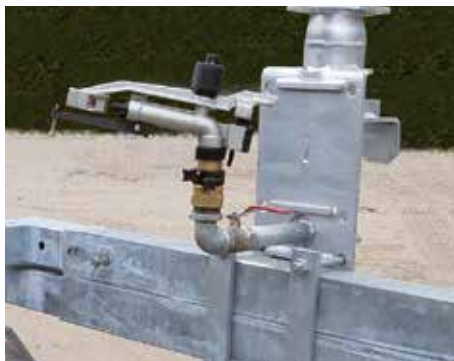
Stretched angle K1 additional rain gun mounted on trolley.