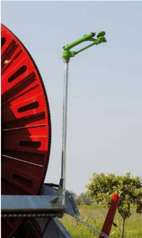
Additional limit switch rain gun controlled by programmer (Skipper or KI model).